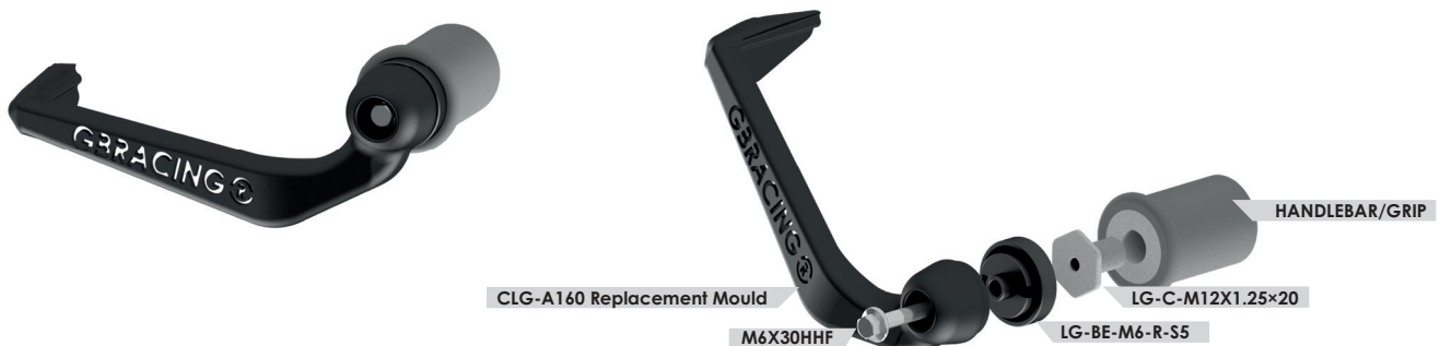
Fig. 1: ASSEMBLY